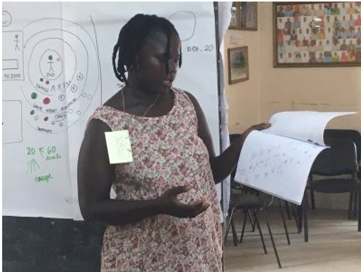
Starting with the agency of individuals and expanding to increasingly larger groups

c) connecting these to people's lives, their fears and hopes and building - local - capacity for collective action are crucial for implementation