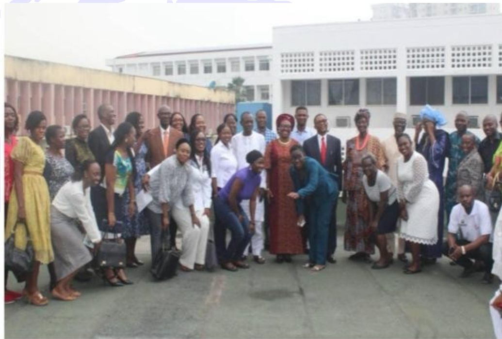
Picture: NiWARD fellows and mentors at the Nigerian Institute for Oceanography and Marine Research (NIOMR), Victoria Island, Lagos

Launched in 2013 as a national chapter of the development programme for African Women in Agriculture Research and Development (AWARD, www.awardfellows.org ) that equips top women agricultural scientists, including fisheries and aquaculture scientists across Nigeria and AWARD Fellows, to accelerate food production gains and economic opportunities for women.