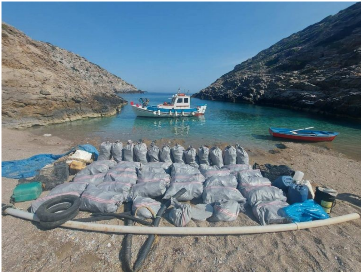
Amorgorama from 2021 plastic collection campaign, 15 tons collected, 3 tons recycled

Lobby the government for protection around the island, seasonal closures to all fishing.