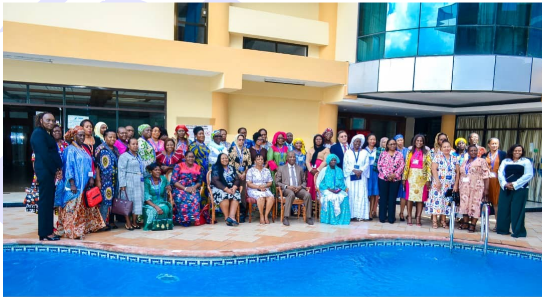
The Africa Women's Fish Processor and Traders Network (AWFISHNET) Consultive and Capacity Building Workshop on Leadership 21-23 March 2024, Peacock Hotel, Dar es Salaam, Tanzania

Supported by African Union-IBAR and the EU, AWFISHNET strengthens women's capacity for defending their rights and efforts for better market access.