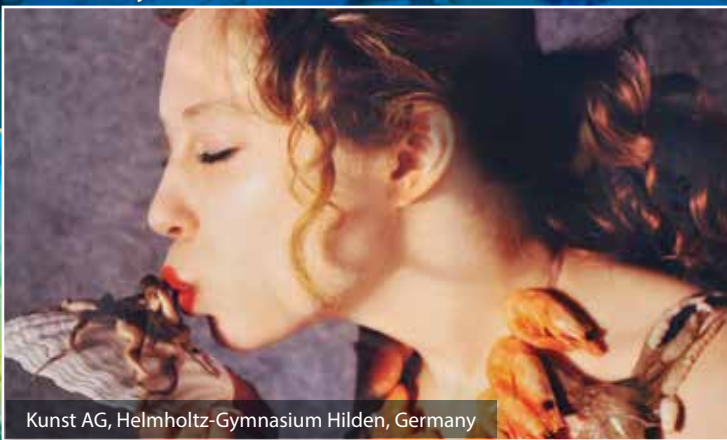
Kunst AG, Helmholtz-Gymnasium Hilden, Germany

To provide scientific and relevant indigenous knowledge and encourage artistic expression about the sea in order to promote its restoration, conservation and sustainable use, to further the study, understanding and respect of aquatic ecosystems and associated biological and cultural diversity.