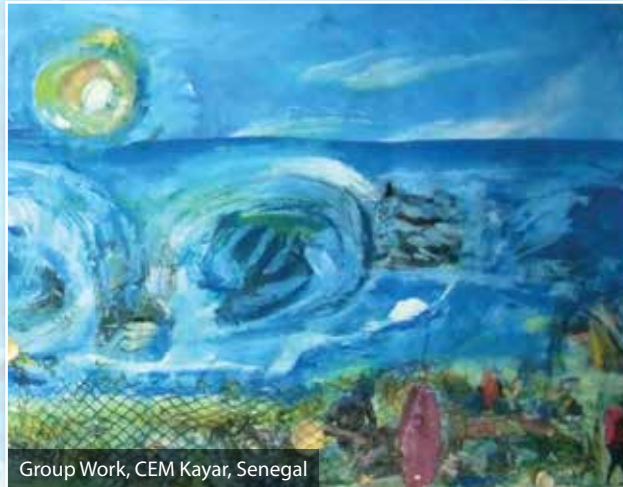
Group Work, CEM Kayar, Senegal

We are scientists, artists, school teachers, concerned parents from different regions of the world, joining forces to promote transitions towards sustainability values and practices as well as human and dignified lives.