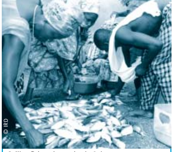
Selling fish at the market in Guinea