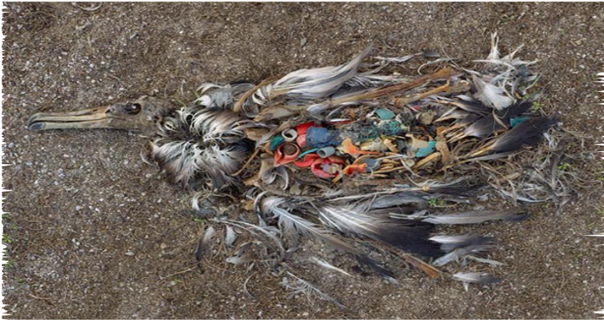
Picture showing dead of marine

mammal as plastics ingest digestive tract.