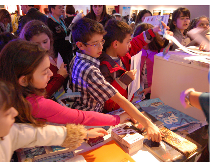
Kids grab info materials and MM fish rulers at the FishBase stand at the Inseparable event in Athens

institutions, the emphasis is shifting towards implementation. Maria Damanaki, Commissioner in charge of this portfolio until September 2014 knew it is about winning the hearts and minds of citizens, not just administrative rules. She wanted to create the conditions and to develop the moral purpose and the values necessary to take us collectively out of the crisis and onto a path of rebuilding, healing and enjoying again the beauty and wealth of the oceans and seas. The reform is pointing in the right direction. But it has some weaknesses, which can best be addressed through broad-based critical engagement of citizens. After all, who 'owns' the fish, if not the public, which needs to exercise stronger stewardship, making better use of research results and working across the spectrum to find robust solutions to the current crisis.