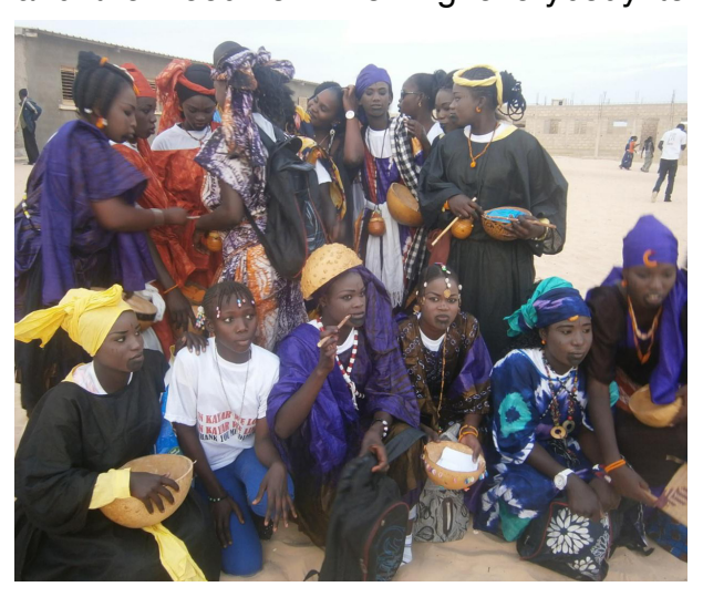
Girls in traditional dress during Culture Day at the CEM in Kayar

awareness about the marine environment and the need for involving everybody to