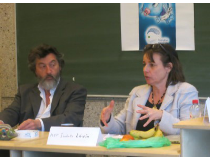
MEP Isabella Lövin during the lunch debate

We had a particularly interesting mix of contributions to Campus Plein Sud at the Free University of Brussels (ULB). The Lunch debate convened in collaboration with the Vice-Rector for International Relations of the ULB and SEDIF on "The international dimension of the implementation of the reform of the European Common Fisheries Policy", Tuesday, 18 March, featured Isabella Lövin, Green MEP from Sweden, together with representatives from the