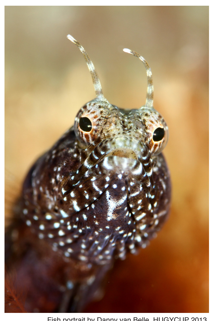
Fish portrait by Danny van Belle, HUGYCUP 2013.

The web resources in five languages (French, English, German, Italian and Spanish) together counted some 3.3 million hits. The average duration/visit was more than five minutes.