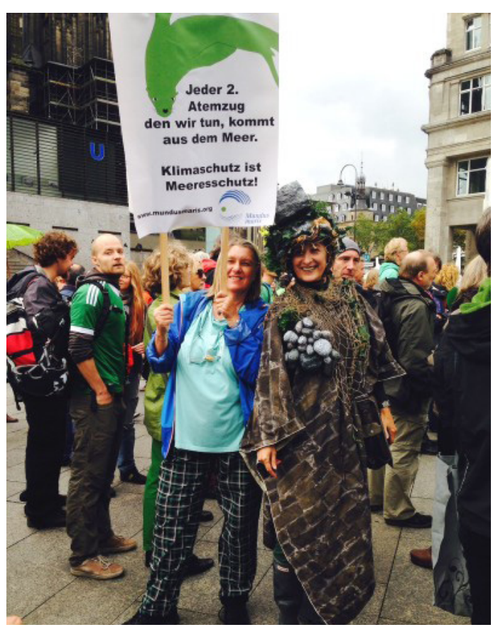
Mundus maris at the climate march in Cologne, Germany

in 162 countries all demanded a breakthrough of the gathering at the UN in New York in preparation to a series of negotiations (2014 in Lima, 2015 in Paris) of a new global agreement to save us from run-away climate change. We contributed in Buenos Aires, Cologne, Düsseldorf, Galapagos Islands. Rome... more here .