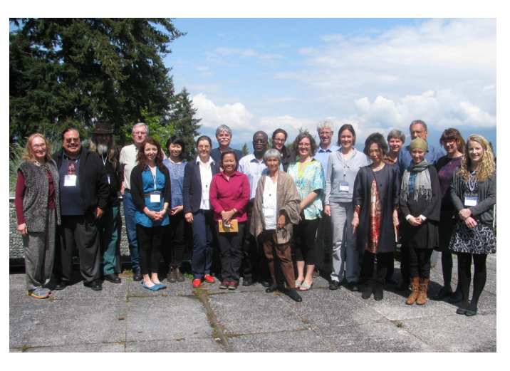
Spaceshippers pose for group photo on day 2

A summary of these five passionate days is on the websites of PWIAS and MM .