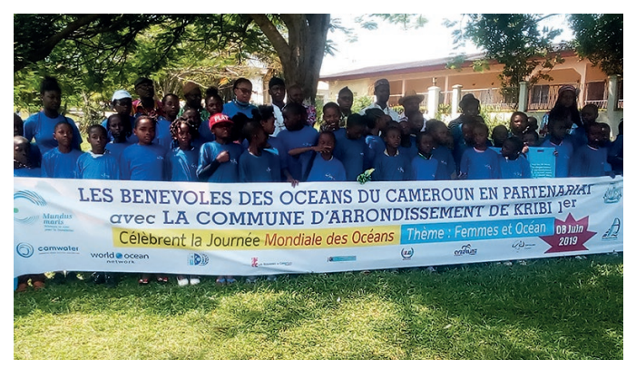
World Ocean Day, Cameroon

Mundus maris and its friends and allies teamed up again this year to celebrate World Ocean Day, 8 June, together around the globe under the UN motto focused this year gender and the ocean. Celebrations entailed a quite diverse programme of activities, starting with the youth contest for Mundus maris Awards. Preparatory and awareness raising activities took place in several countries. Celebrations reached their culmination with special events on three continents: taking off in Brussels, Belgium, and followed by other engaging events in Argentina, Cameroon, Nigeria and Senegal. <u>Check out</u> what happened there.