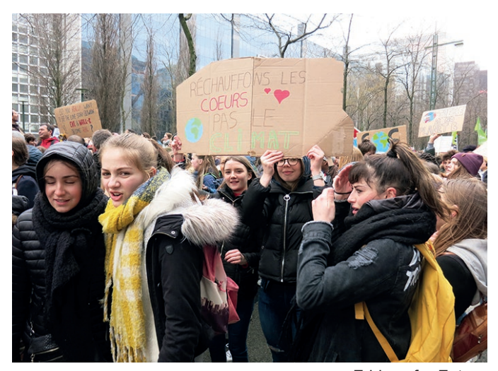
Fridays for Future

Throughout the year, there were other specifically climate related activities, such as <u>climate marches</u> in September, including support for the <u>COP25</u> in Madrid towards the end of the year, which was disappointing. So we all together need to redouble efforts.