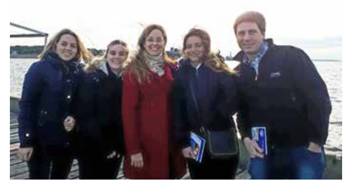
Winners student contest for World Ocean Day, Buenos Aires

Mundus maris and its friends and allies teamed up again this year to celebrate World Ocean Day, 8 June, together around the globe under the UN motto focused on protecting the ocean – and ourselves - from hideous plastic pollution. Celebrations entailed a quite diverse programme of activities, starting with the youth contest for Mundus maris Awards. Preparatory and awareness raising activities took place in several countries. Celebrations reached their culmination with special events on three continents: taking off in Brussels, Belgium, and followed by other events in Argentina,