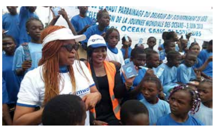
After the beach clean-up in Kribi, Cameroon

Cameroon, Nigeria and Senegal. <u>Check out</u> what happened there.