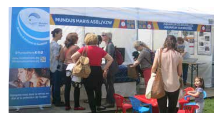
World Oceans Day Celebrations in Brussels, Belgium

The culmination of a lot of preparatory and outreach work for World Oceans Day were special events organised by Mundus maris and our partners in Brussels (Belgium), Douala (Cameroon), Mombasa (Kenya), Akure and Victoria Island (Nigeria) and Hann (Senegal). Thanks to the events, large numbers of people could get first-hand information about the ocean, participate in sports- and cultural programmes, beach clean-ups and more. Each event centred