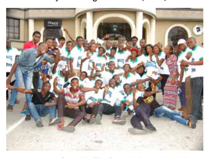
Green Me Film Festival Victoria Island Nigeria

the Green Me Global Film Festival celebrating its maiden performance in Nigeria, the group enjoyed the festival itself, both by viewing some of the world-class films and informing visitors about ocean issues. The gala was the highlight at the end with the Awards Ceremony for the winning films. Great emotions around the sustainability challenges "Ocean, Life, Water"!