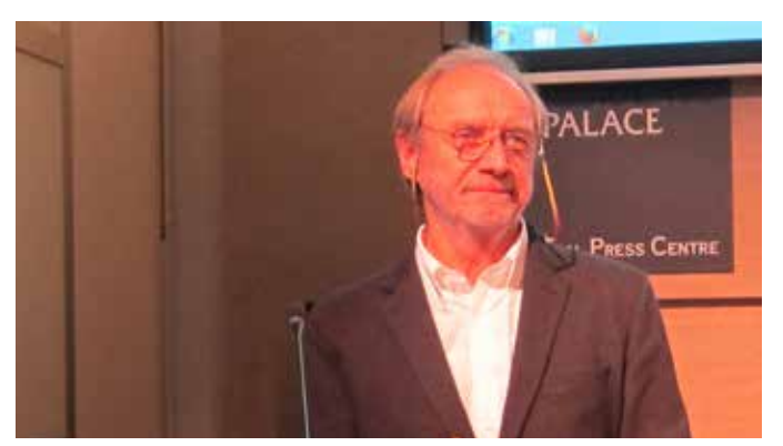
Dr Rainer Froese presenting the path-breaking study on possible production gains at a press conference in Brussels

Resources from the Sea, Ocean Sciences Colloquium Bremen, 23 November 2016